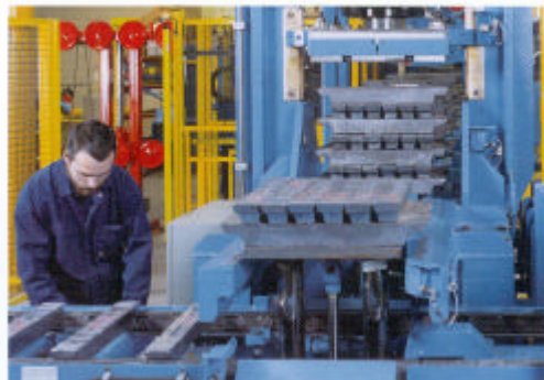
Automatic Ingot Casting Machine. Casting rate is 1440 ingots per hour.