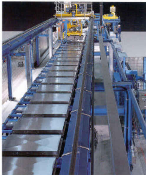
Automatic 18.2 Tonne Block Casting Machine requiring one operator. Output is 27 tonnes per hour.

Lewis Australia Pty Ltd 87-89 Cochrane Road, Moorabbin, Victoria 3189, Australia