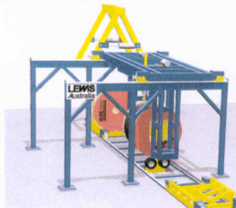
Simulation of cable winding system with overhead crane.

The fully automatic gantry robot crane has a positional accuracy of +/- 1mm in 30 metres of travel and is the enabling technology for the casting machine. Its high speed and accuracy contributes to the exceptional casting performance. The integrated PLC and SCADA system controls the gantry crane and associated equipment, to automate the entire process of casting blocks.