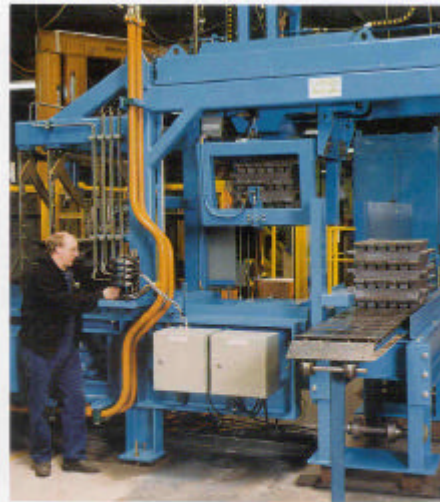
Automatic lead ingot gantry transfer and doubling station.

Using the latest proven technology, manually controlled processes and existing cranes can be upgraded to fully automatic operation, improving productivity, process control, product tracking, product quality and operator safety. Lewis Australia's automation skills give you the opportunity to rethink your production processes and achieve new benchmarks.