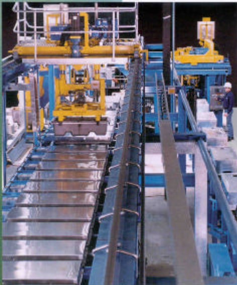
Automatic Casting Machine featuring servo controlled crane.